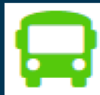
School Bus Stop

is pleased to offer the "School Bus Stop" which is located on our website at www.sd23.bc.ca